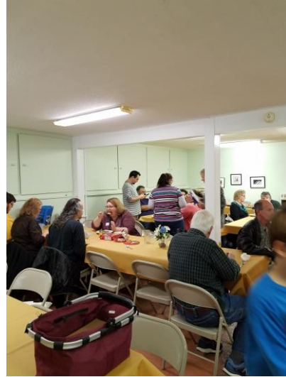
Thanksgiving Potluck Fun Time

After the service we all chowed down on the church's annual Thanksgiving potluck. The Hot Springs Unitarian Universalist Church has some fantastic chefs among its congregation. Thank you everyone who contributed to our feast and socializing event.