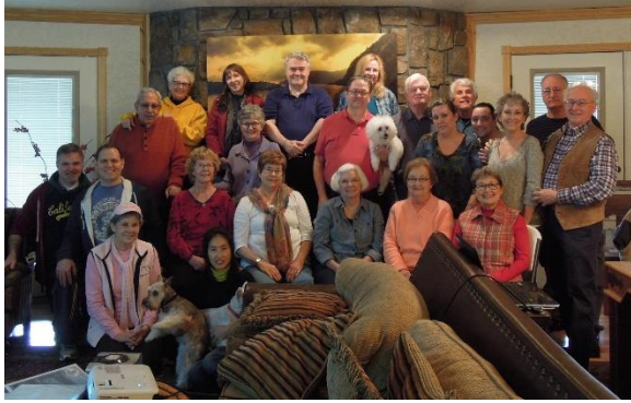
FAMILY- CHRISTMAS 2017

Please contact me at crowha@sbcglobal.net if you have any suggestions or submissions for the Church Newsletter.