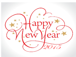
This Photo hv