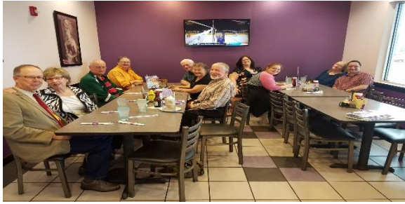
LUNCH AFTER CHURCH SERVICE