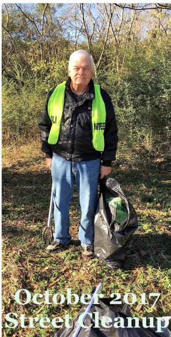
October 2017 Street Cleanup