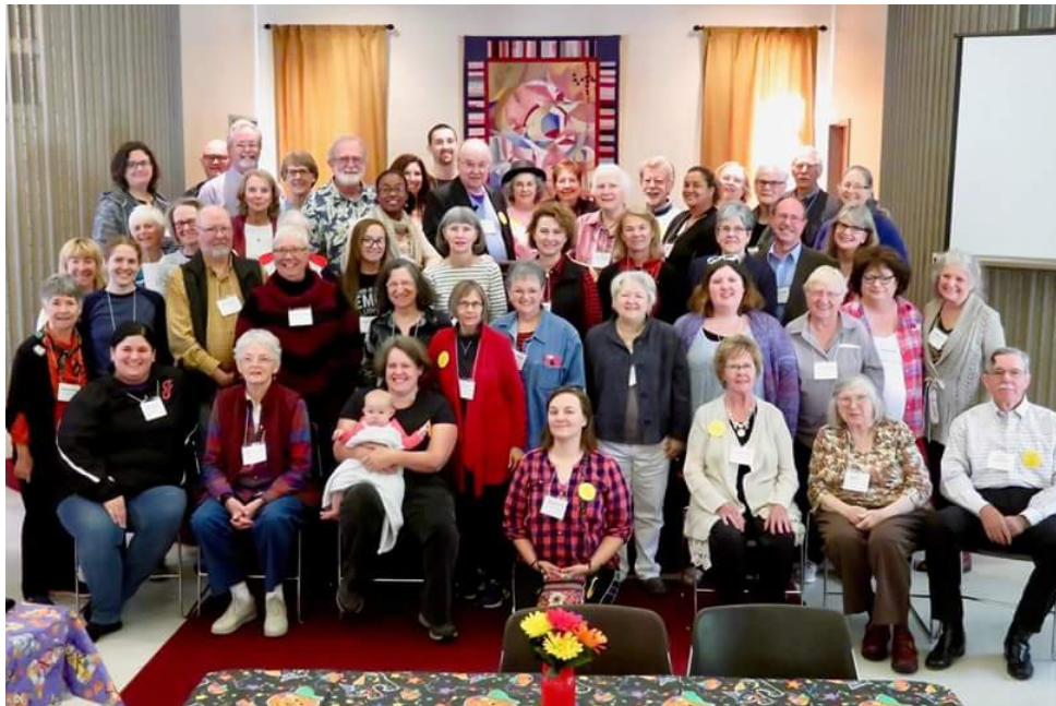
UU Cluster in Little Rock, October 2017

Our potluck on October 29 proved that our group loves to eat together! I just watched a few minutes and the excitement was so comforting. We always have plenty of excellent food and plenty to discuss. I love the way all ages come together. So, we will certainly start having more potlucks. Watch your email for details each month.