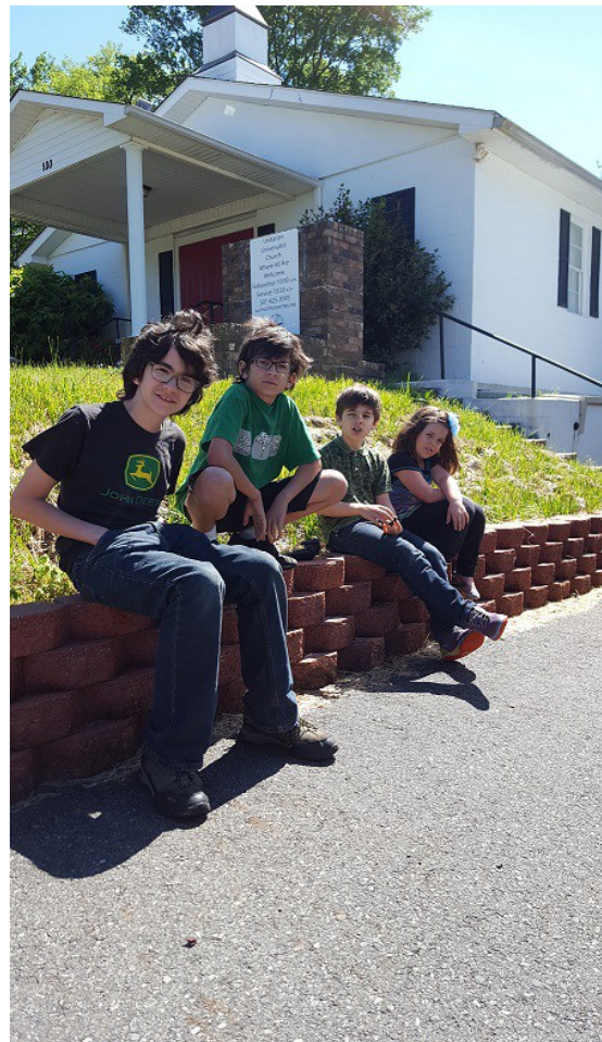
Cute UU Kids!

Please email Dorothy Clark (dclark1620@att.net) or call (501) 318-3210 if you are able to help.